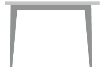
IMAGE AVAILABLE SOON

Two-seater seat with lacquered aluminium structure, cushions and upholstery suitable for outdoor use, and backrest in braided trimming tape on aluminium tube. Wide range of colours and combinations to choose from the optional cushions.