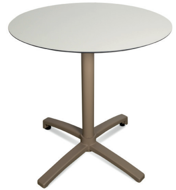
Table in painted aluminium. Folding system. Indoor and outdoor use. HPL tabletop.