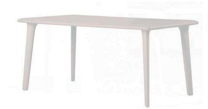
Table for indoor and outdoor use. Table top and legs injected in polypropylene. Powder coated zink steel structure in accordance to corrosion regulation UNE EN/ISO 9227:2012. UV protection. Available in 2 sizes: 90x90, net weight 11,74 kg (25.88 lb), 160x90, net weight 16,75 kg (36,93 lb).