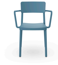
Lisboa Armchair Retro Blue 05080