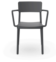
Lisboa Armchair Dark Grey 00961