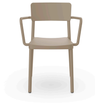
Lisboa Armchair Sand 00953