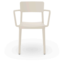
Lisboa Armchair Ivory 07056