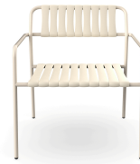
Lounge Armchair Gelato Nacar + Slats Nacar 06975