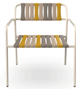
Lounge Armchair Gelato Nocciola Nacar 06925