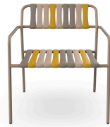
Lounge Armchair Gelato Nocciola Duna 07283