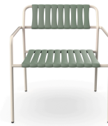
Lounge Armchair Gelato Nacar + Slats Salvia 06949