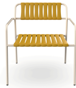
Lounge Armchair Gelato Nacar + Slats Albero 06954