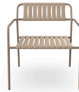
Lounge Armchair Gelato Duna Slats Duna 07292