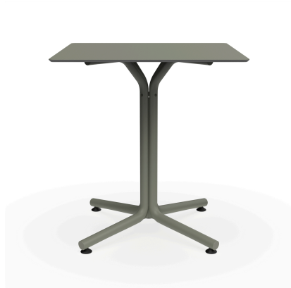
Bini Table Green Grey Hpl Green Grey 70x70 06626