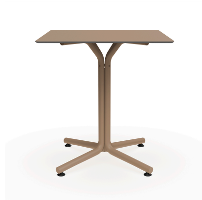
Bini Table Sand Hpl Sand 70x70 06628