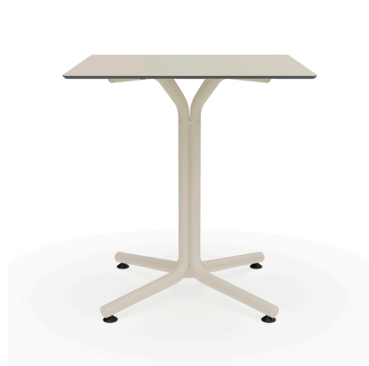
Bini Table Ivory Hpl Ivory 70x70 06627