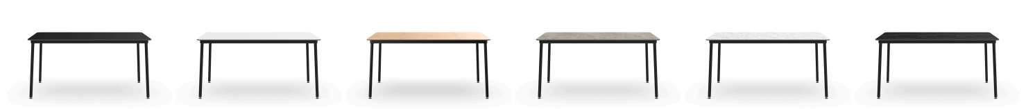
Table Hub Black 150x90 Hpl Black 06343