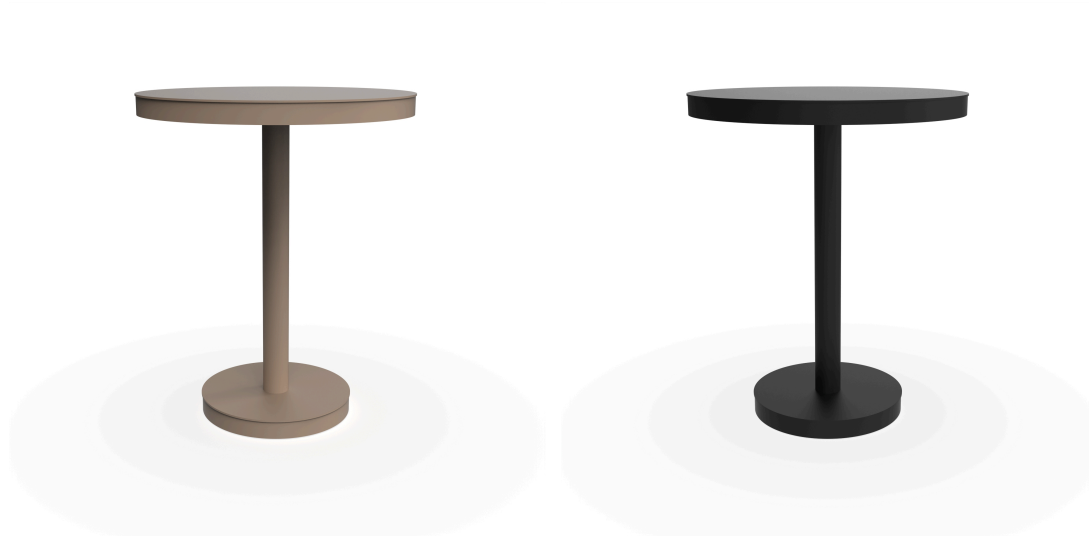
Barcino Sand Table Ø60 Central Leg 01431