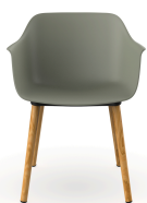
Silla Shape Wood Gris Verdoso 05310