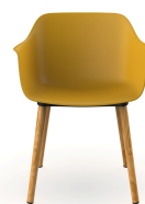
Silla Shape Wood Toscano 05314