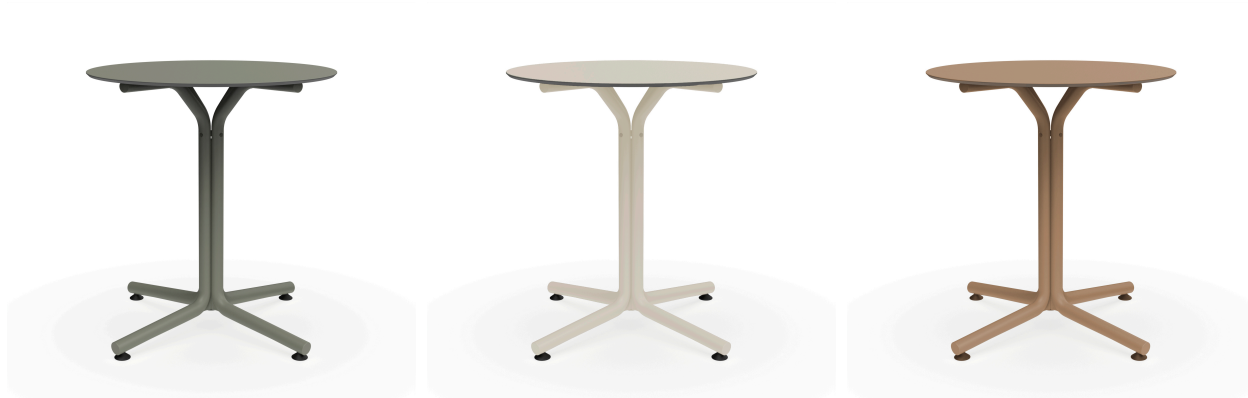
Bini Table Green Grey Hpl Green Grey Ø70 06074