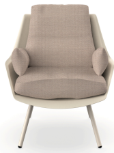
Anou Sofa Nacar Mud 07062