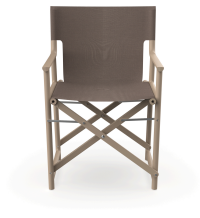
Boss Duna Chair Mocha Fabric 06825