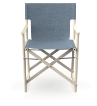
Boss Nácar Chair Denim Fabric 06828