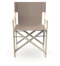
Boss Nácar Chair Mud Fabric 06827