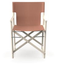
Boss Nácar Chair Amber Fabric 06826