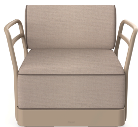
Brisa Duna Sofa Cushion Mud + Mocha 06801