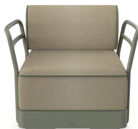
Brisa Salvia Sofa Limonetto Cushion + Fern 06803