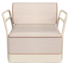
Brisa Nacar Sofa Hazelnut Cushion + Amber 06802