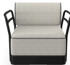
Brisa Noche Sofa Cushion Salina 05 + Dolce 55 06804