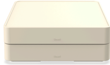
Brisa Nacar Table Double Base 06773