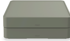
Brisa Salvia table double base 06774