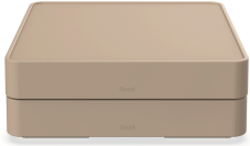
Brisa Duna double base table 06772