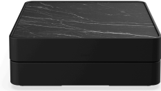
Brisa Noche Table double base 06775