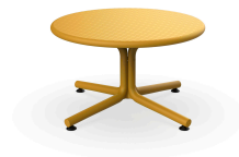
Tuscan Bini Lounge Table 05402