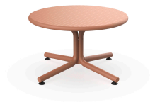
Terracotta Bini Lounge Table 05401