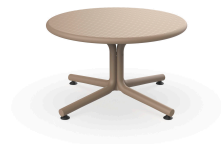
Sand Bini Lounge Table 05403