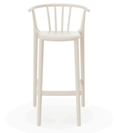
High Woody Ivory Barstool 05444