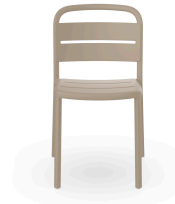
Como Chair Sand 05346