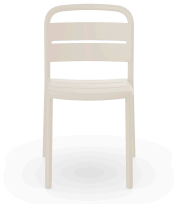
Como Chair Ivory 05343