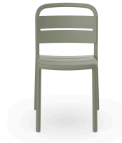
Como Chair Green-Grey 05345