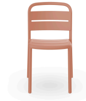
Como Chair Terra Cotta 05347