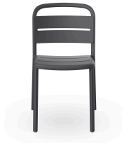
Como Chair Dark Grey 05344