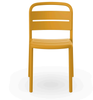
Como Chair Tuscan 05348