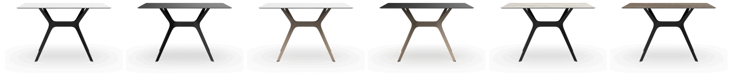
Mesa Vela M 120x80 Negra / HPL Bianco 03094