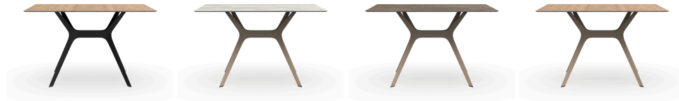
Mesa Vela M 120x80 Negro / HPL Roble Natural 04095