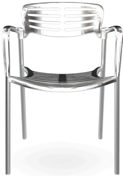
Toledo Armchair 70000