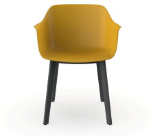
Silla Shape Toscano patas Click 05193