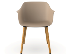
Silla Shape Wood Arena 05311