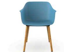
Silla Shape Wood Azul Retro 05313