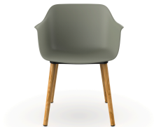
Silla Shape Wood Gris Verdoso 05310