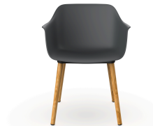
Silla Shape Wood Gris Oscuro 05312