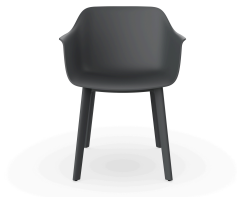
Silla Shape Gris Oscuro patas Click 05191