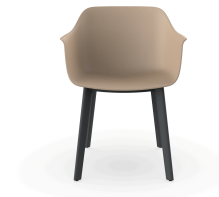
Silla Shape Arena patas Click 05461