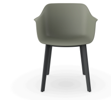
Silla Shape Gris Verdoso patas Click 05462