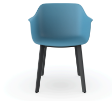
Silla Shape Azul retro patas Click 05460