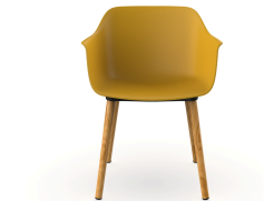
Silla Shape Wood Toscano 05314