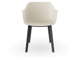
Silla Shape Marfil patas Click 07037