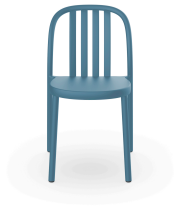
Sue Lamas Chair Retro Blue 05170