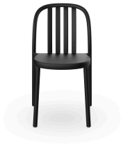
Sue Lamas Chair Black 05168