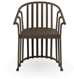
Chocolate Raff Armchair 04913