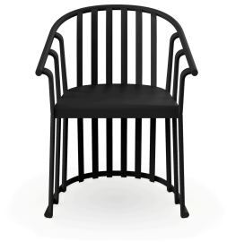
Black Raff Armchair 04909