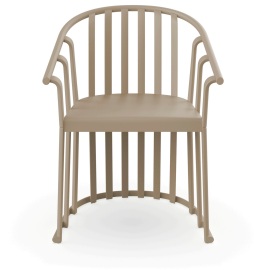
Sand Raff Armchair 04908