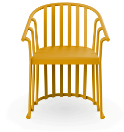
Toscano Raff Armchair 04912