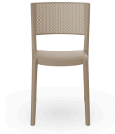
Spot Chair Sand 01653