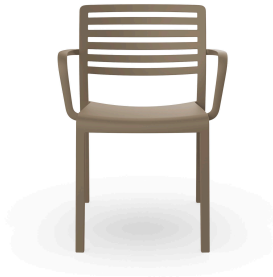
Lama Armchair Sand 01326