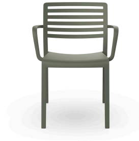
Lama Armchair Green-Grey 07055